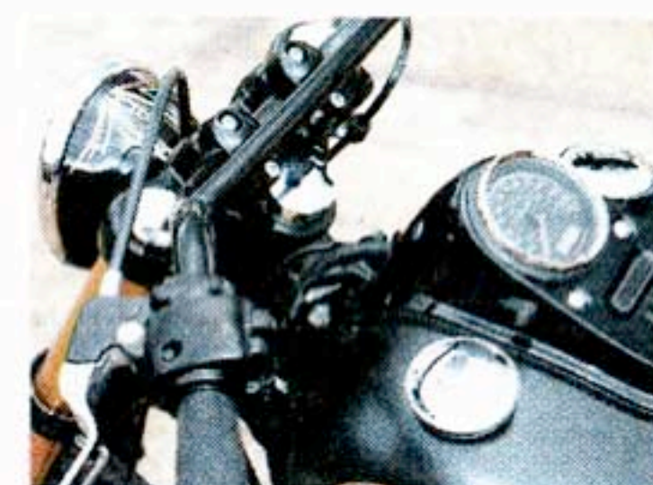
Tribal design is repeated on the headlight. Wiring is tucked away

as well as the rider. Sat comfortably on the vintage replica seat, the bars are positioned to make smooth steering inputs, the bike's reactions belying its weight and tall front tyre. It's all too easy to drop into rebel-like antics of noise and blindingly quick getaways.