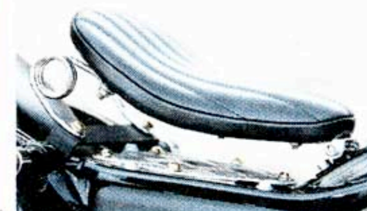
Sprung seat offers real comfort