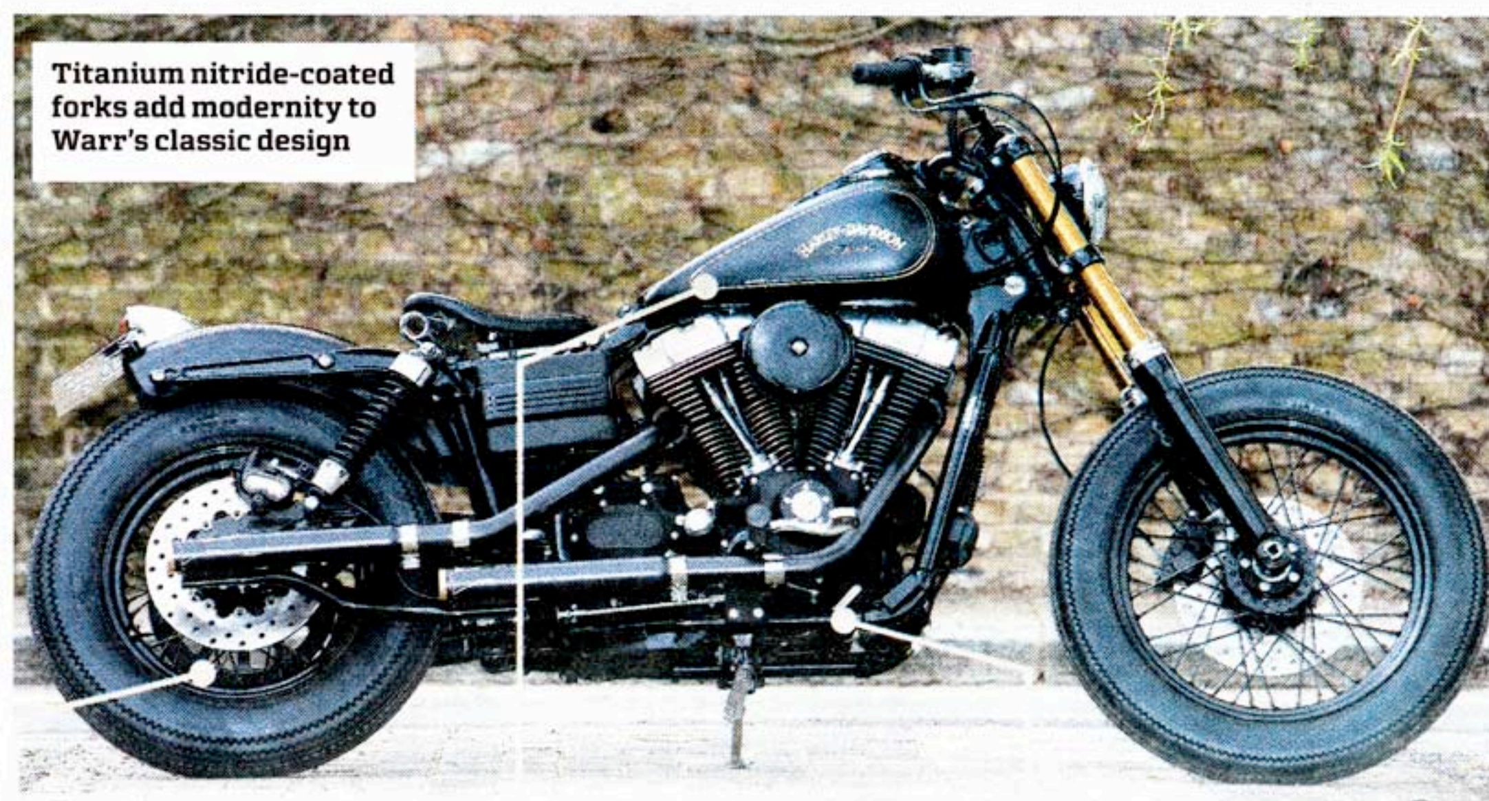
Titanium nitride-coated forks add modernity to Warr's classic design