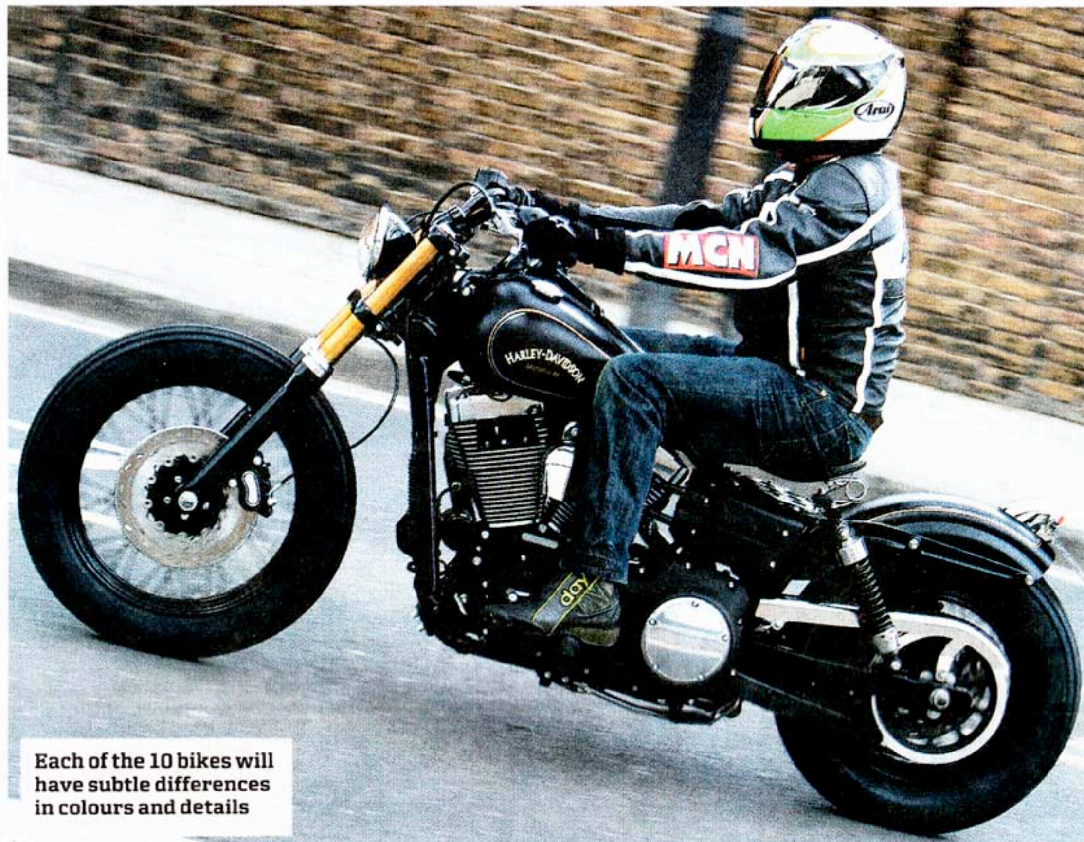
Each of the 10 bikes will have subtle differences in colours and details

Harley 883R handlebars, modded with a crossbrace, suit the bike to a tee